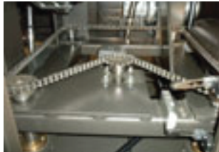
Motorized Adjustment of Seal Head No Crank Handles to Adjust