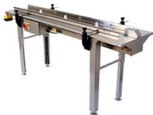
Optional 3' or 6' flighted or belted infeed conveyor