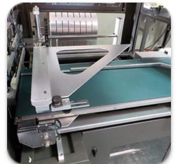
"APA" Automatic Product Size Adjustment of Inverting Triangle & Infeed Conveyor *Exclusive Feature!