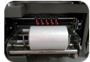
Front Load Film Cradle with Pin Perf Wheels, Saves Space