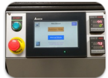
6" Color Touch-Screen with 40 Presets and Self Diagnostics

Reliability, simplicity and ease of maintenance should provide years of dependable performance at low operational cost. The PP-5600 CS is an extremely versatile machine capable of running a wide variety of industrial or consumer products. The PP-5600 CS features a Motorized Center Seal that allows for precise seam placement and taller package heights.