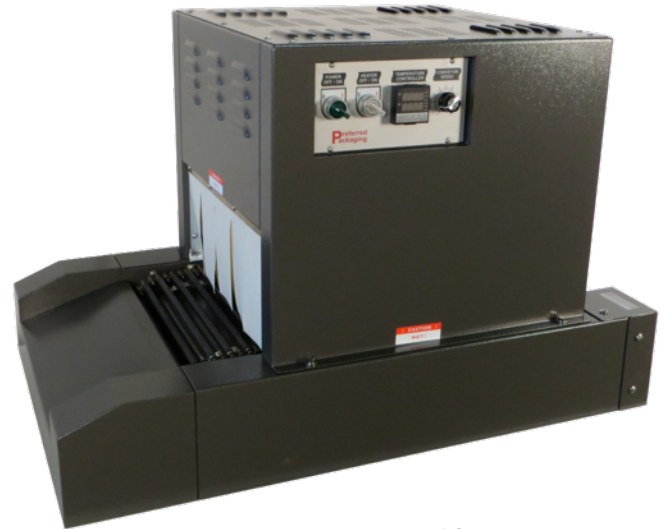
Table Top Version

The model PP1606-20 Shrink Tunnel (16"W x 6"H x 20"L chamber size) is a General Purpose Entry Level Heat Shrink Tunnel which can be used for a wide variety of applications such as laying bottles down and using full length PVC shrink sleeves, shrinking pre-form shrink bands over containers, using regular cut shrink bands, can be used as a curing tunnel or a drying tunnel. This tunnel can also be connected to an L'Sealer and used to shrink wrap packages. Features discharge slide on exit end of shrink tunnel to easily move completed packages away from shrink tunnel conveyor.