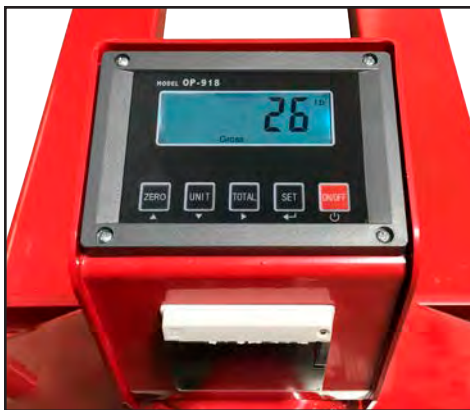
Easy to use Indicator with printer