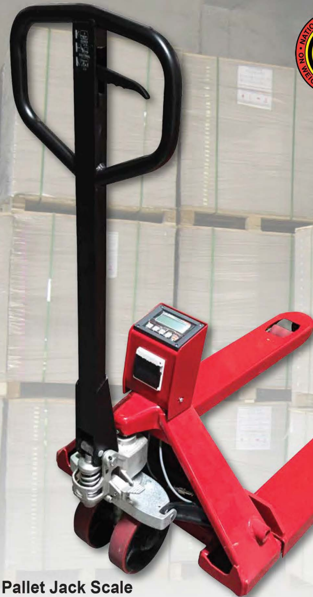
Pallet Jack Scale With Printer