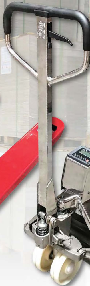
Stainless Steel Pallet Jack Scale