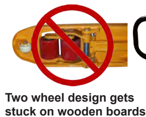
Two wheel design gets stuck on wooden boards