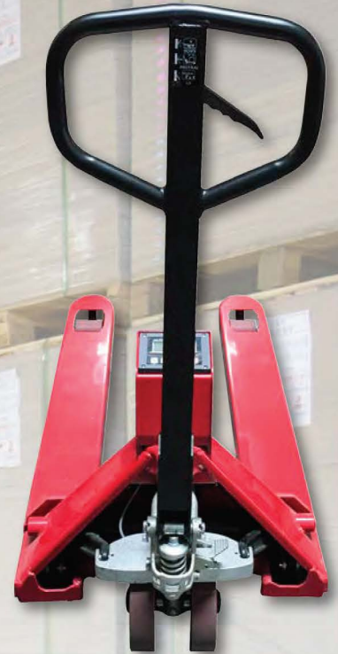
Pallet Jack Scale Without Printer